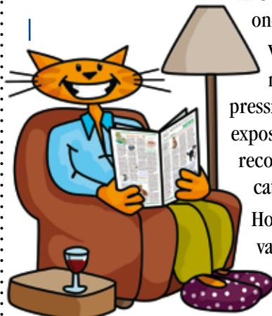
"I can relax – I am!"

However the good news is that there are very effective vaccines against the virus, and your cat can be vaccinated at the same time as the annual health check and other vaccinations. Don't take the risk – please contact us for further information or an appointment!